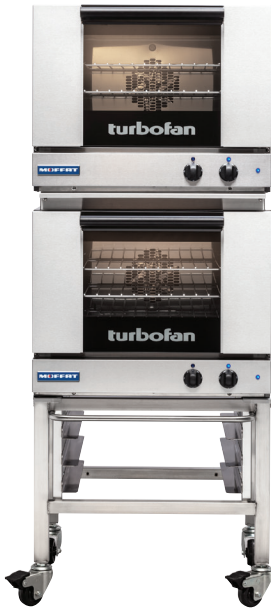
Model E22M3/2C shown

Double Stacked on a Stainless Steel Base Stand