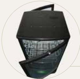
Double lockable curved doors